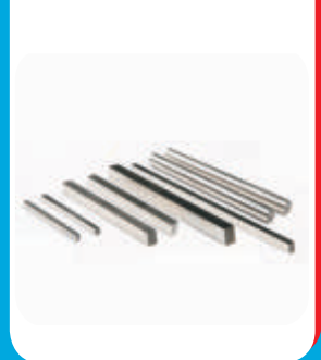
HSS TOOL BITS