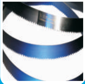
ADDISON junior ® BI-METAL BAND SAW BLADES