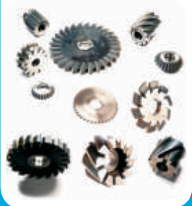
HSS MILLING CUTTERS