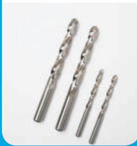
"Hurricane" ® HARDWARE DRILLS