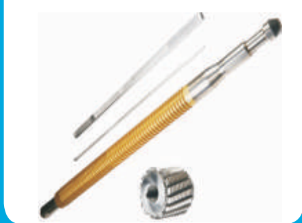
HSS BROACHES & HOBS